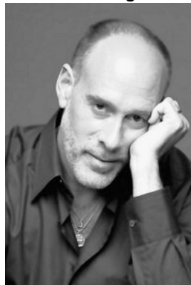
Grammy Award-winning singer Marc Cohn comes to the Keswick Theatre Jan. 25 with a new CD and a new lease on life.

It's been nearly a decade since Marc Cohn released an album. He blames it on a bad case of writer's block. Writer's block can be like the hiccups or the flu. It can stick around and linger like an unwanted distant relative or sometimes something extreme has to happen to shock it out of your system.