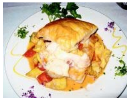
Cappesante Ariana, sautéed shrimp and scallops with artichoke hearts and fresh diced tomatoes in a brandy Marsala sauce, topped with mozzarella and served in a pastry box.