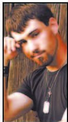
By HAILA FRANCIS STAFF WRITER

More than 20 area artists will come together today in a benefit concert to aid the musicians devastated by the Nashville floods.