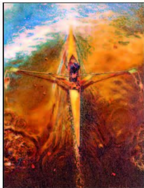
"On the River"